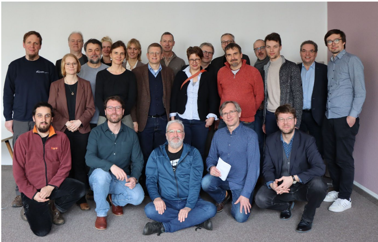
Fig. 1. Kick-off meeting of the principal investigators of the DFG Priority Programme 2361 “On the Way to the Fluvial Anthroposphere” at Leipzig University on the 9 th to 10 th of March 2023.

The DFG Priority Programme 2361 “On the Way to the Fluvial Anthroposphere” is based on the key hypothesis of a pre-modern emergence of a Fluvial Anthroposphere. All sub-projects of the Priority Programme investigate medieval and pre-industrial floodplains and fluvial societies in the Rhine, Danube and Elbe river systems and asks when and why humans became a significant controlling factor in floodplain formation. The Priority Programme is committed to multidisciplinary approaches from history, archaeology, and geosciences.